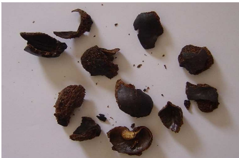
FIGURE 2 – Rinds of cashew nuts after burning on LCC: non-uniform pieces

and CNSL is destined for exportation (SANTOS et al. 2007). The rinds of cashew nut (wastes of nuts' production) are burned again during the heating process (Fig. 2), and in boilers, they'll generate heat for shelling other nuts. The ARCN is the waste collected from the boiler grid, resulted from burning of the rind of nuts. This waste is used as composts in plantings of cashew and a little part of it is dumped in landfill sites (LIMA, 2008).