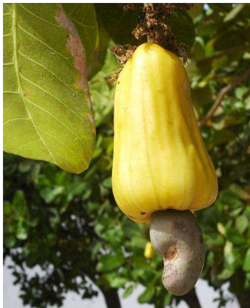
FIGURE 1 – Cashew: nut and apple (yellow)

The plant is found in Central America, Africa, Asia and India, Vietnam and Brazil stand out as the largest producers of cashew nut (70% of the world production).